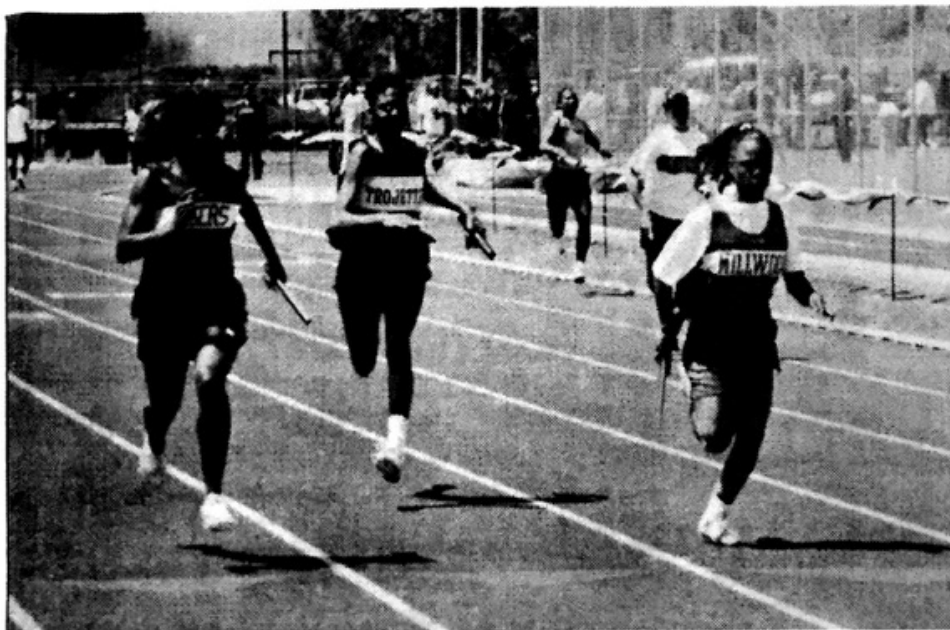
JOHN JACOBS INVITATIONAL--Millwood brings home the baton in first place in the Division II girls' 400 relay here at the University of Oklahoma April 15. Ardmore was second followed by Douglass.