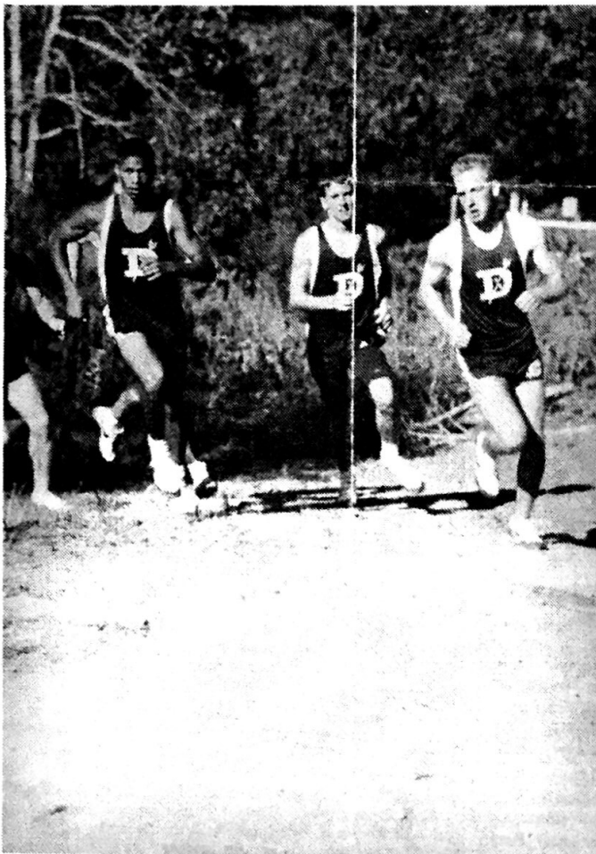
LITTLE AXE INVITATIONAL--The Duncan boys negotiate the first turn as a pack on the tough Little Axe course here September 4 in the 4A-5A race. The Guthrie boys took the 4A crown with Norman hauling in the 5A title.