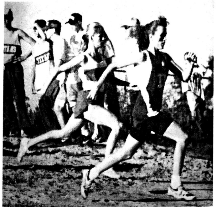
LITTLE AXE INVITATIONAL--Two girls battle for position on the opening downhill here in the 4A-5A race September 4 on one of the most challenging cross country courses in the state. Durant captured the 4A team title with Moore taking the 5A crown.