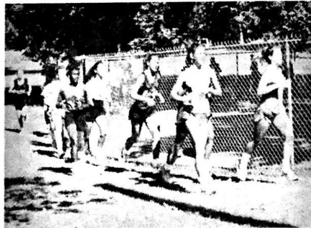
TOP --Part of the girls' 2A-3A starting line in the season's opening meet at Tishomingo August 21st. Plainview took the team title over Marlow 19-53.