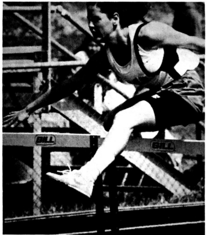
SULPHUR INVITATIONAL--Lone Grove's McCalister clears a hurdle enroute to a 4th place finish in the 100 meter hurdles April 2nd.

100: Wilson, Millwood, 10.3/Schumpert, Washington, 11.96 200: Creason, Owasso, 21.46/ Schumpert, Washington, 25.55. 400: Samuels, Okmulgee, 48.30/Fontenot, Bartlesville, 58.26. 800: Thayer, Norman, 1:56.95/Roberts, John Marshall, 2:21.81. 1600: Digby, Putnam North, 4:25.10/Boothe, McGuinness, 5:22.9. 3200: Rush, Enid, 9:37.29/Mann, Shawnee, 11:49.26. 100H: Blackshire, Norman, 14.08/Burns, Washington, 14.51. 300H: Logan, Enid, 39.40/ Schenk, Watonga, 46.68. 400R: Edmond North 42.68/Okmulgee 50.10. 800R: (girls only) Millwood 1:45.1. 1600R: Norman 3:25.0/Millwood 4:07.7. 3200R: Putnam City 8:03.97/Norman 10:02.5. Shot: Bookout, Stroud, 56-6/Schlegel, Union, 42-2.75. Discus: Bookout, Stroud, 172-11/(tie) Schlegel, Union, 126-11 Long Jump: Bryson, Clinton, 22-8/ Williams, Wynnewood, 18-5.5. High Jump: Seigrist, Merritt6-8.6/Holland, Jay, 5-6. Pole Vault: Wilkinson, Stroud, 16-0.