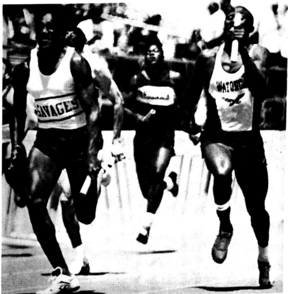
2A BOYS STATE MEET--Wynnewood and Watonga go at it in the finals of the 400 meter relay with the Savages taking home to gold medal.

Hydro's Jared Black repeated as a double winner again in the 1600/3200 along with Roderick Davis of Grandfield in the 100/200 and Brad Cornelison of Texhoma in the hurdles.