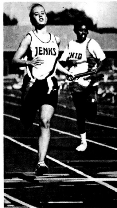
SA REGIONAL AT JENKS--The Trojan girls won the 800 meter relay with a time of 1:47.29 followed by Enid in second.

Pole Vault: 1. Wilson, Med. 12-0; 2. Westfahl, Ring. 9-6; 3. Dixon, Wau. 9-6; 4. Watsck, Med. 9-0; 5. Major, Ringood. 8-0.