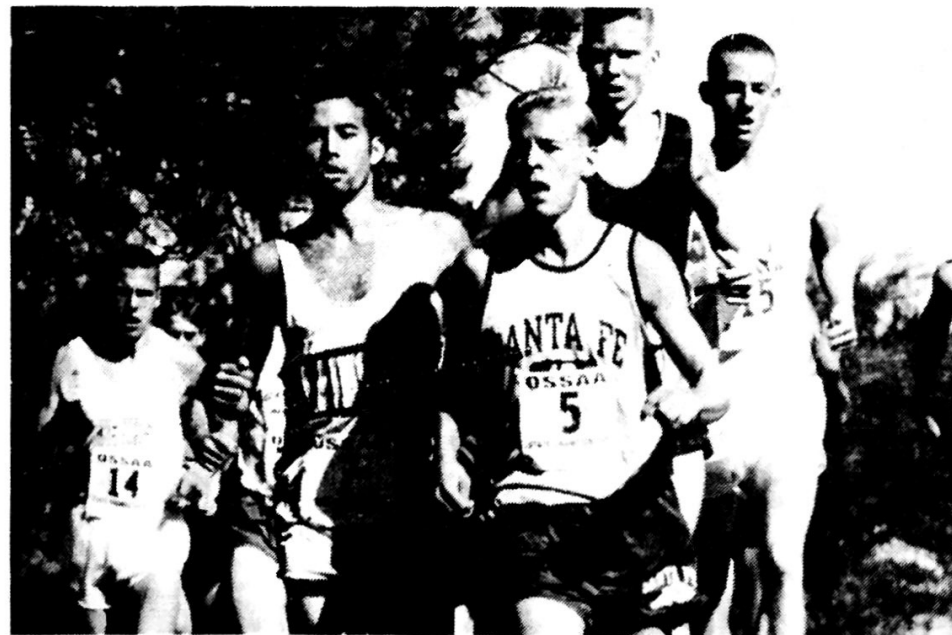
5A BOYS STATE CHAMPIONSHIP--The lead pack at about the half mile mark.