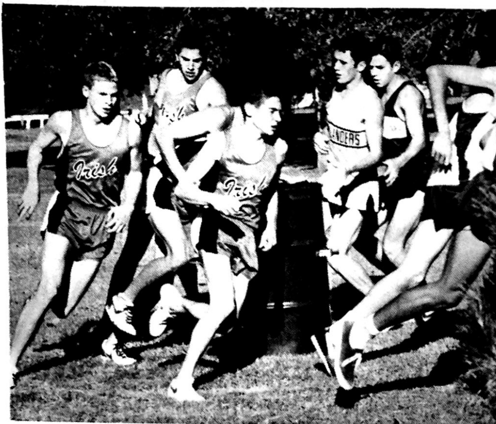
PUTNAM CITY WEST INVITATIONAL --The 4A boys pack takes a hard turn around a barrel at Oklahoma City's Lake Overholser October 1st.