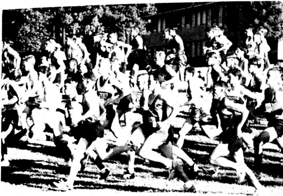
CC CLASSIC--The 5A boys start in the pre-state meet held at Oral Roberts University October 11th.

233; 10. Siloam Springs 234; 11. Grove 270; 12. Jay 284; 13. Catoosa 285; 14. Sand Springs 329; NS--Muskogee, Caney Valley, Bristow.