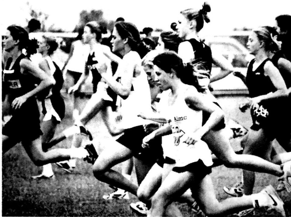
OBU INVITATIONAL--The 2A-3A girls sprint from the start September 24th on the Elks golf course in Shawnee.