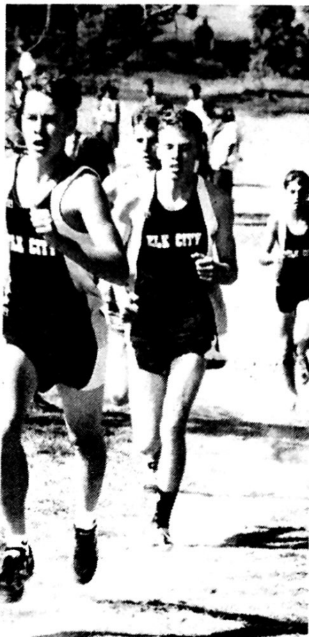
WEST REGIONAL--Elk City is at the front of the pack near the half mile mark in the boys 3A race.