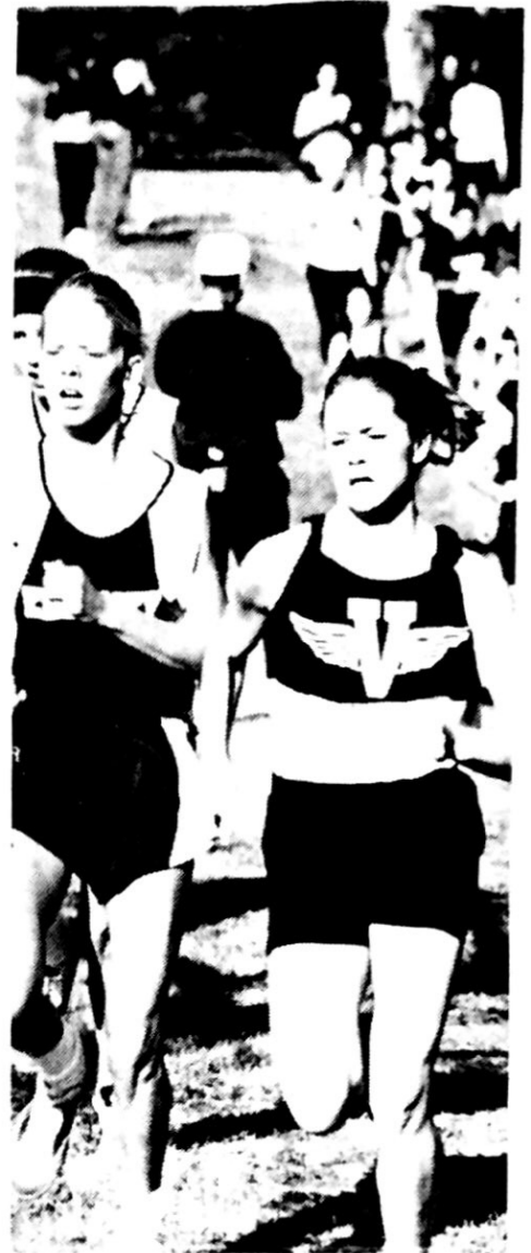
BOMBER INVITATIONAL--Elk City and Vanoss led the pack near the 600 meter mark. The Plainview girls won the team title and Elk City was second.