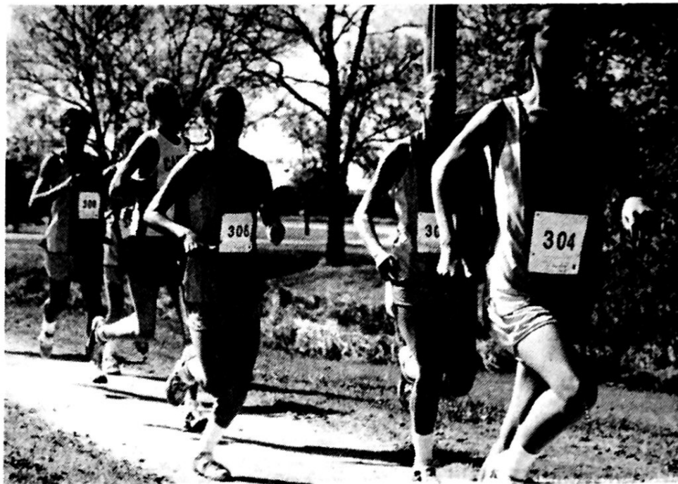
EAST REGIONAL--The Little Axe girls head the 3A pack early in the race.

the West Regional by 39 points over Lindsay.