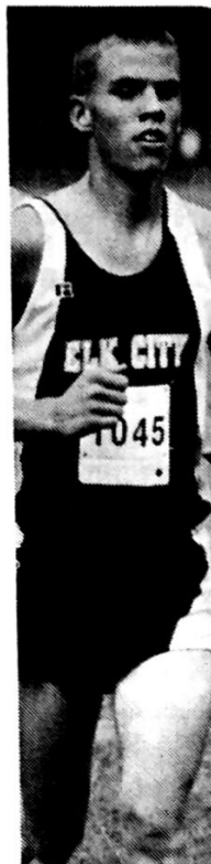
Utah Robinson Elk City