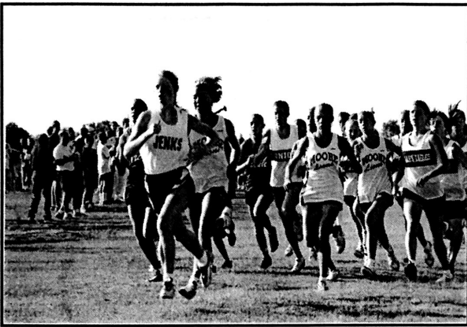
MARLOW INVITATIONAL--4A-5A girls at the start.