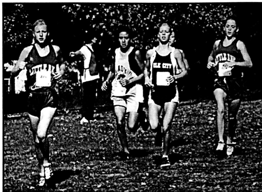
CLASS 3A GIRLS STATE CHAMPIONSHIPS--The chase group goes through at about 1000 meters.