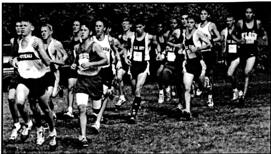
CLASS 3A BOYS STATE CHAMPIOSHIPS-- The chase pack goes through the three-quarter mile point.