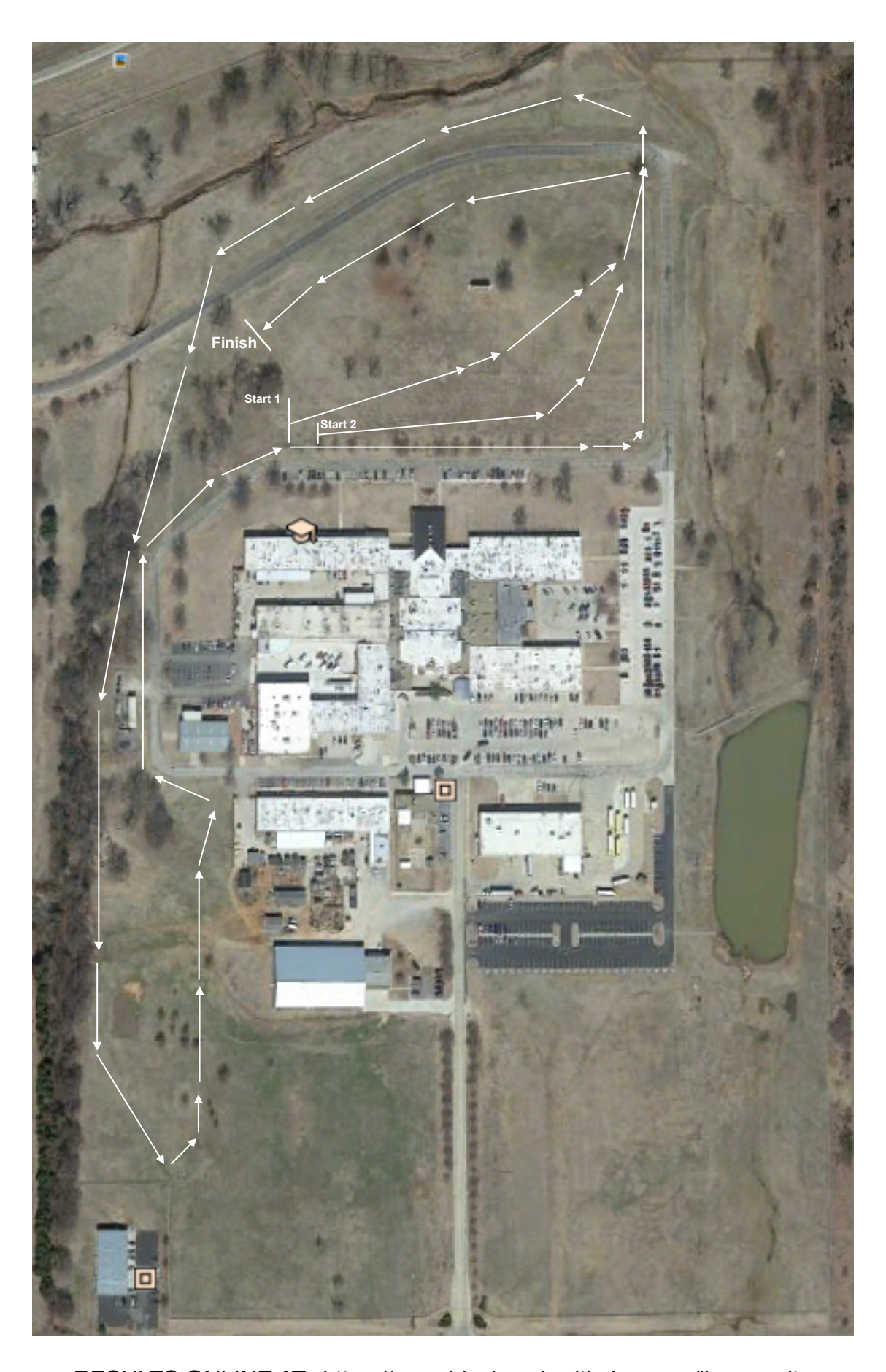
RESULTS ONLINE AT: https://www.blacksquirreltiming.com/live-results