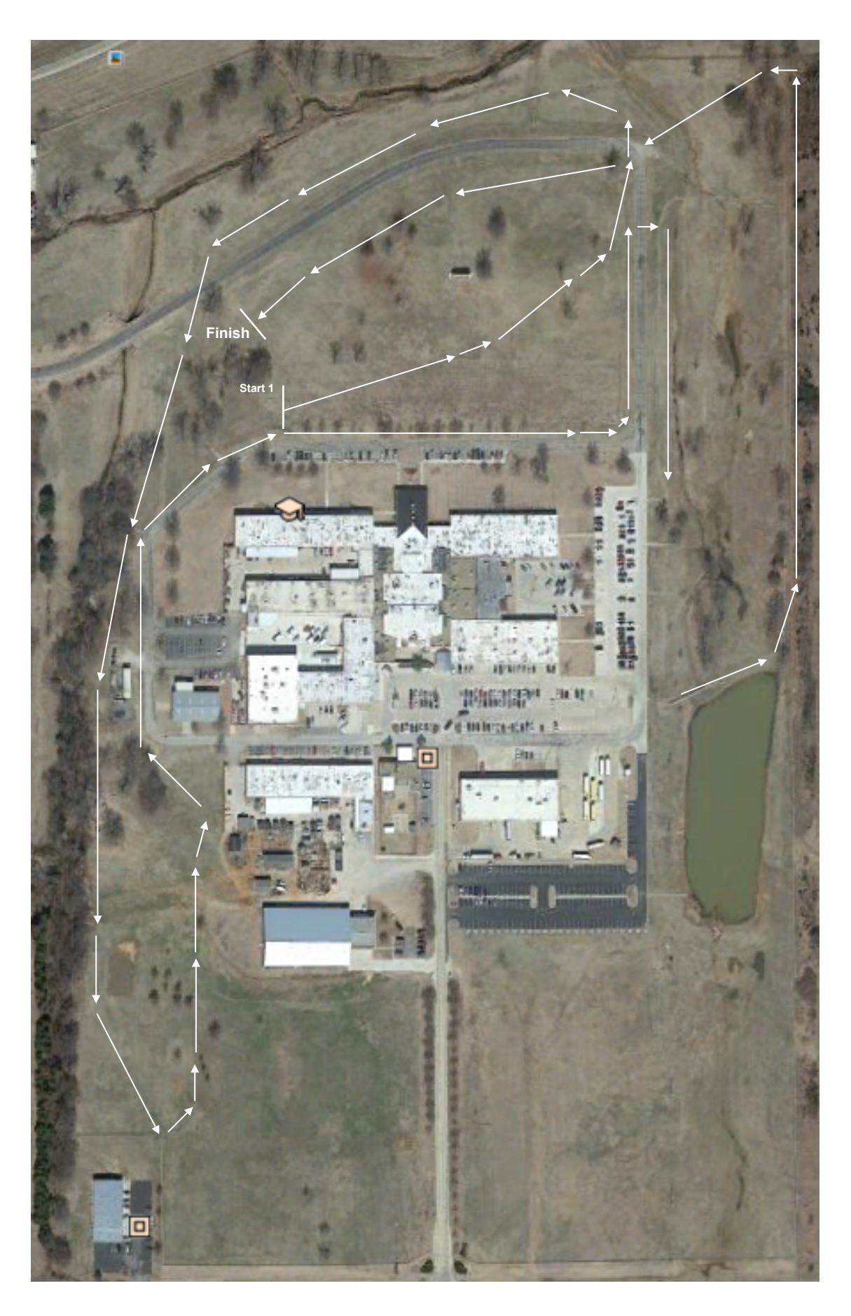
RESULTS ONLINE AT: https://www.blacksquirreltiming.com/live-results