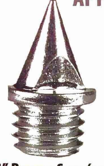
1/4" Pyramid Spike (cone)