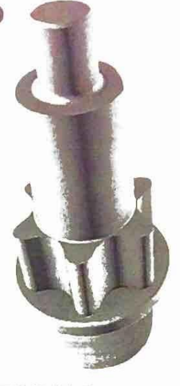
12MM TORX CYLINDER SPIKE (HIGH JUMP ONLY)