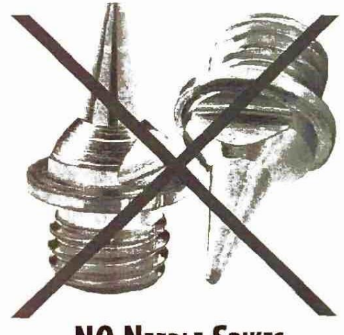
NO NEEDLE SPIKES