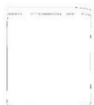
ONE (1) GALLON CLEAR PLASTIC STORAGE BAG