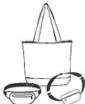
12" X 6" X 12" CLEAR TOTE (ANYTHING LARGER IS PROHIBITED) CLEAR FANNY PACK CLEAR CROSSBODY BAG