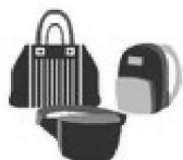
NO PURSES, BACKPACKS, DRAWSTRING BAGS, FANNY PACKS, DIAPER BAGS, CROSSBODY BAGS & BINOCULAR CASES