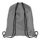
SOLID OR CLEAR DRAWSTRING BAG