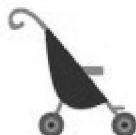
NO STROLLERS OR BABY CARRIERS