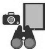
BINOCULARS, CAMERAS & TABLETS